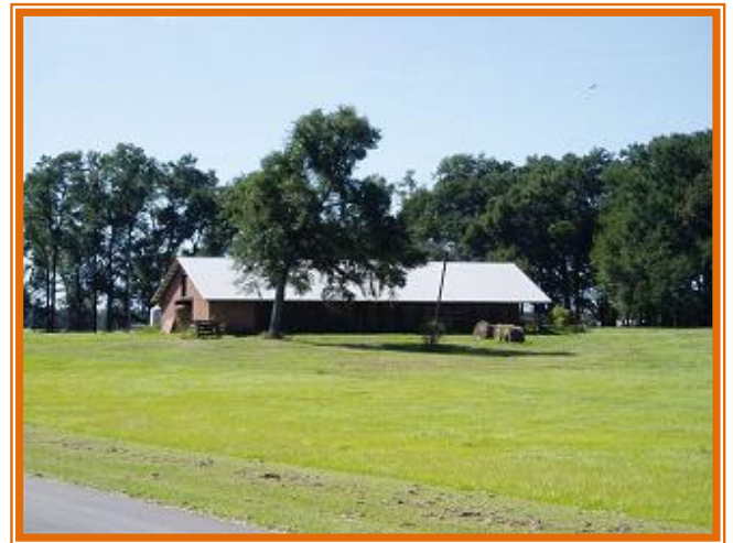
Barn on Property