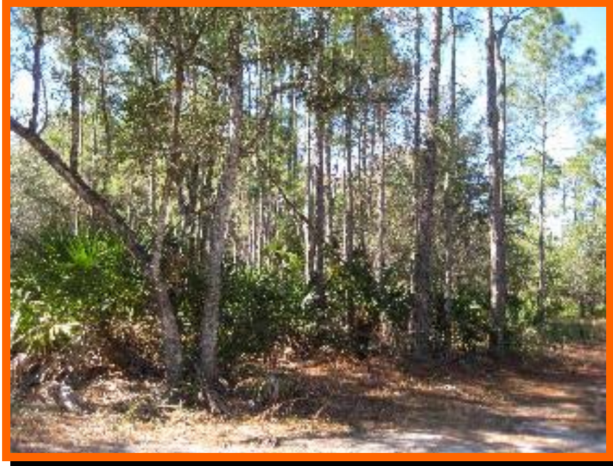
Ocala Development Corp of Marion County, Inc.